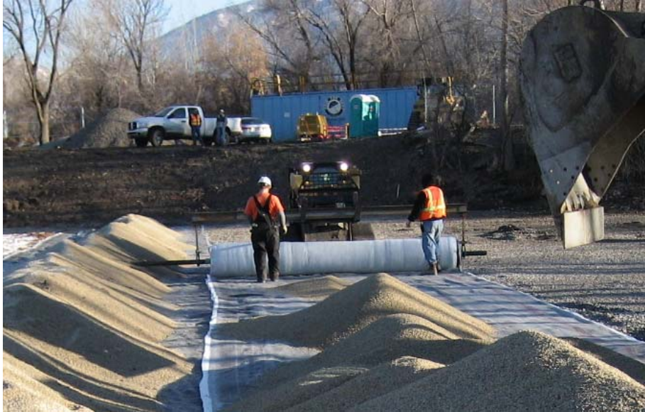
Figure 2. Organoclay Reactive Core Mat deployment